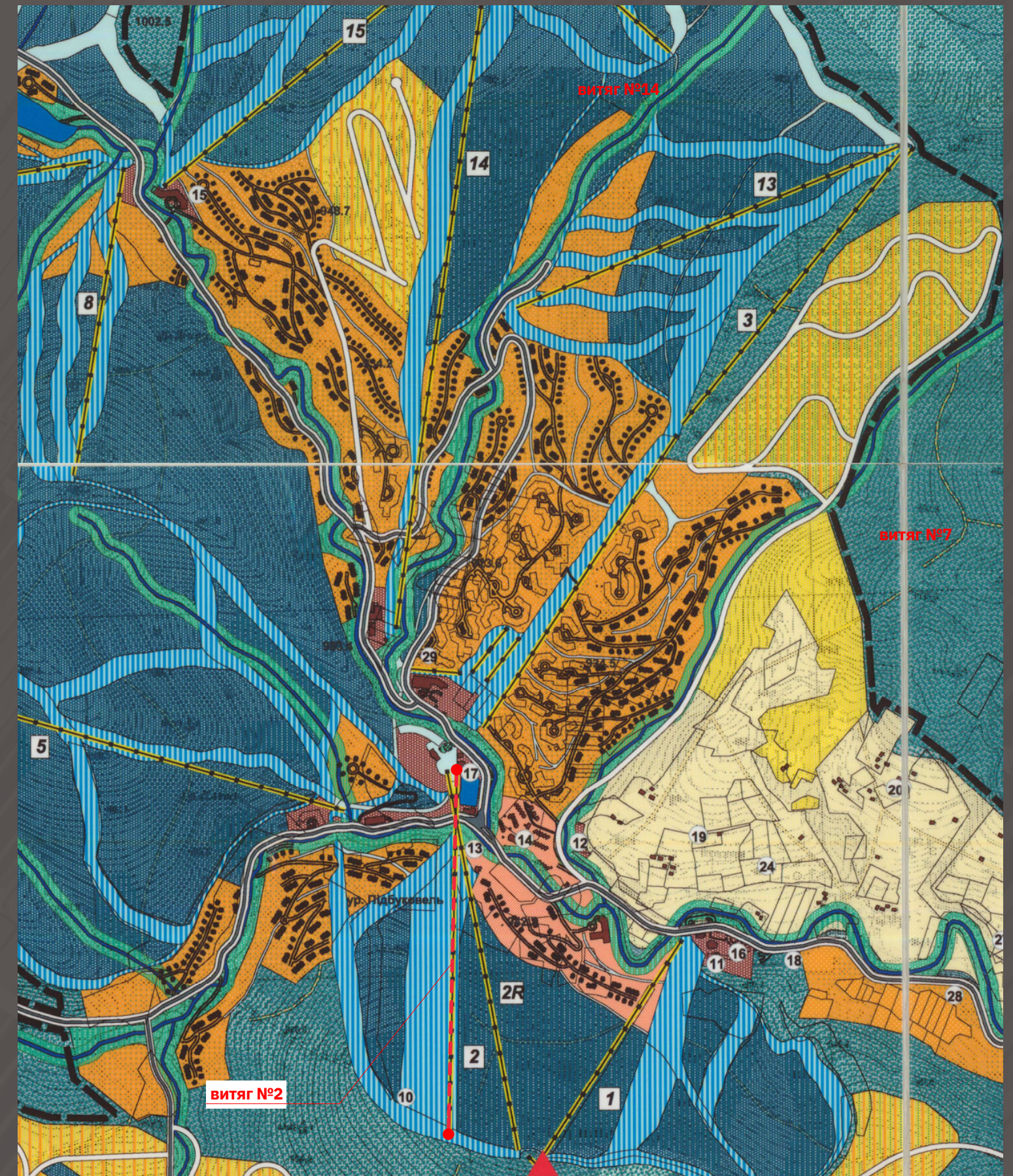
Викопіювання з генплану населеного пункту М 1:10000

16. The design solutions of the competition participants shall be developed on the basis of a topographic plan with the boundaries of the land plot specified in the appendices to these Conditions.